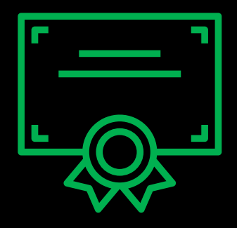
All purchase happens as per the compliance and certifications